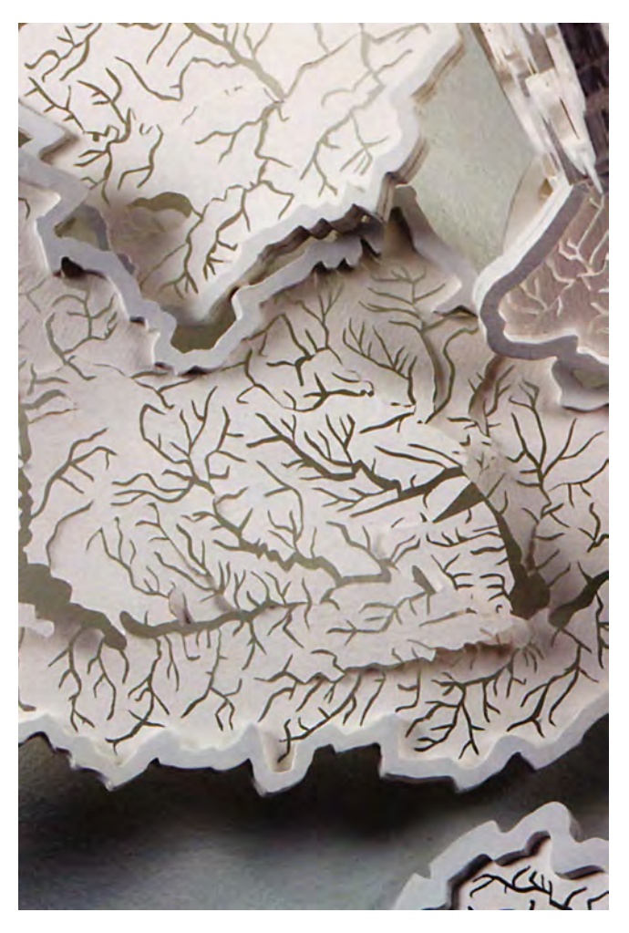
ABOVE: Lauren Rosenthal, Delaware River Anatomy (with detail), 2008; watercolor paper, wood, paint, hand-cut, painted; 60" x 36" x 18".

Each of these three artists uses a different language for addressing the plight of our planet—the universally grasped lingo